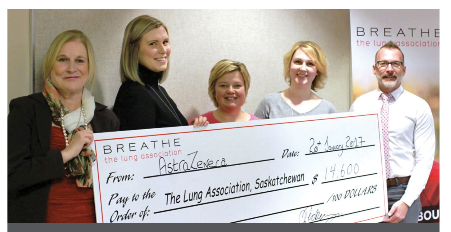
AstraZeneca continued their investment in our RESPTREC® courses, helping us to maintain Canada's premiere education courses on respiratory health care.